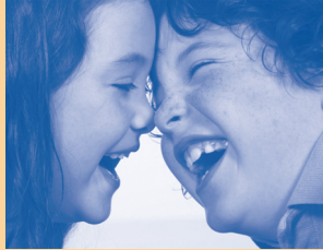
Youth & Families