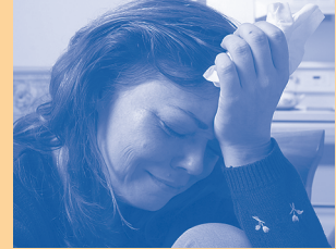
Safety & Intervention