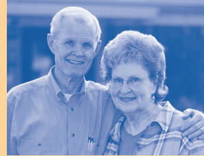
Food & Shelter